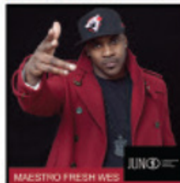
MAESTRO FRESH WES