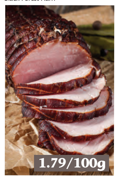
Black Forest Ham