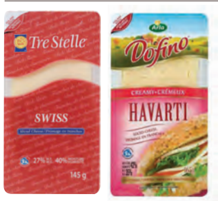
Tre Stelle or Dofino Cheese Slices assorted varieties