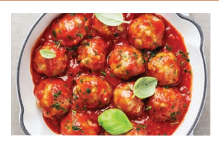
Choices' Own Ground Chicken raised without antibiotics 24.23kg