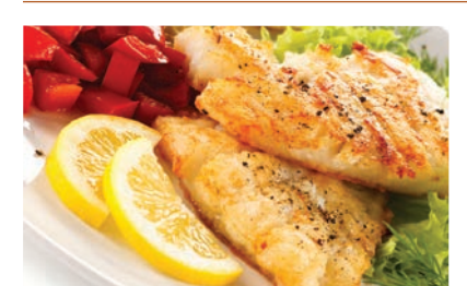
Iceland Cod Fillets 41.87kg