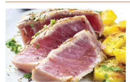
Wild-Caught Ahi Tuna Loin Steaks Sashimi Grade 44.07kq