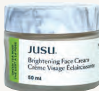
Jusu Facial Care Assorted Varieties & Sizes

At BUZZD, we believe that health starts from within and it's important to fuel our bodies with the right nutrients so that we have the energy to feel and perform at our best! We've created a line of dairy-free, better-for-you coffee creamers and gave each a boost with amazing superfoods to provide a variety of health benefits. If you're not a coffee drinker, our blends go well in smoothies, oatmeal, tea and much more!