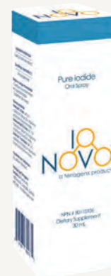
IO Novo 30 mL

Ashwagandha is a well-recognized Ayurvedic herb that has been shown to have many health benefits related to physical and mental stress. It is traditionally used in Ayurvedic medicine to balance aggravated Vata (as a nerve tonic), as a sleep aid, for memory enhancement, and to relieve general debility.