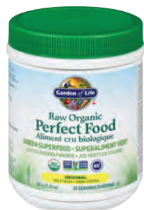
Garden of Life Raw Organic Perfect Food Greens Assorted Varieties 207g - 285g

Blood Sugar Balance is a comprehensive and holistic approach to the restoration and maintenance of normal blood glucose. It addresses the three primary concerns associated with diabetes. Blood Sugar Balance is a comprehensive and holistic approach to the restoration and maintenance of normal blood glucose. It addresses the primary concerns associated with maintaining healthy blood-sugar control. The nutrients in Blood Sugar Balance work from several different perspectives; they exert an insulin-like effect, improve insulin sensitivity, and support healthy nerves from free-radical damage associated with unregulated blood-sugar levels.