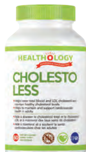
Healthology Cholesto-less 60 Softgels