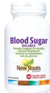
New Roots Blood Sugar Balance 60 Capsules

Kyolic® Aged Garlic Extract™ Formula 109 for Blood Pressure Health contains 400 mg of AGE along with Nattokinase, an enzyme extracted from natto (fermented soy) and L-Theanine, a nutrient found in green tea per serving (2 capsules; Recommend two servings per day). Clinical studies for each of these ingredients have shown to support healthy blood pressure levels, already within normal ranges. Kyolic AGE is the best-selling, odourless, aged garlic extract. Proven safe and effective, AGE and its constituents have been the subject of over 870 peer-reviewed published scientific papers that document its health benefits.