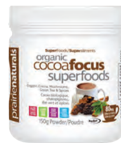
Prairie Naturals Cocoa SuperFoods CocoaFocus or CocoaImmune 150g

Zinc is an essential trace mineral for human health. It plays an important role in various body functions, such as: • Immune function • The metabolism of proteins, carbohydrates and fats • The digestion of nutrients • Connective tissue formation • Wound healing For the immune system in particular, zinc is vital - a lack of zinc can affect the normal functioning of immune cells. The immune system is complex and encompasses various different types of cells that work together to eliminate pathogens. Zinc is necessary for cell differentiation, allowing stem cells to become specialized immune cells.