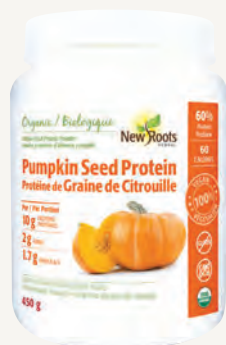
New Roots Organic Pumpkin Seed Protein Powder 450g