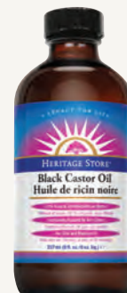
Heritage Store Black Castor Oil 237 mL

The Green Tea Rose Brightening Face Cream is specifically formulated for normal to sensitive skin. This luxurious Vegan cream combines the power of plant-based ingredients to deliver exceptional benefits. Rose Flower Water works wonders by retaining moisture and providing a rich source of Vitamin C for a youthful glow. Aloe Leaf Juice, packed with antioxidants and vitamins A & C, soothes inflammation and treats superficial acne. Mango Seed Butter moisturizes, rejuvenates, and enhances radiance while reducing sun-induced dark spots. Shea Butter conditions and tones skin, offering anti-inflammatory properties. Lastly, Green Tea Leaf Extract, a true miracle ingredient, unclogs pores, lightens blemishes, and keeps your skin hydrated. Experience the ultimate skincare rejuvenation today!