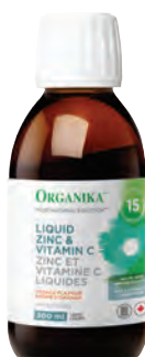
Organika Zinc with Vitamin C 300 mL

Raw Organic Perfect Food products are power packed with greens, vitamins, minerals, and enzymes. Garden of Life maximizes nutrient density by JUICING grasses, then using low-temperature drying to create powders for six times more concentration. Raw Organic Perfect Food® is packed with the power of 40 nutrient dense, RAW, Certified USDA Organic juiced greens, sprouts and vegetables with no fillers or added sugars. Raw Organic Perfect Food® is also grown by our family farmers on organic farms in Utah. We harvest our greens before the grain buds (to prevent gluten from forming), then juice at the farm immediately. Our juice is gently low-temperature dried and powdered on site, locking in its nutritionally dense, high bioavailability.