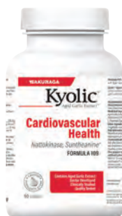
Kyolic Cardiovascular Health 60 Capsules

The typical North American diet contains far too many foods that increase our cholesterol levels above and beyond what our bodies can use. Excess total cholesterol and LDL "bad" cholesterol will stick to the walls of our blood vessels, narrowing the space for blood to flow. This prevents oxygen and nutrients from reaching vital organs. Most dangerously, it can prevent oxygen from getting to the heart or brain, increasing our risk for heart attack and stroke. CHOLESTO-LESS, is formulated to lower total cholesterol and LDL "bad" cholesterol and raise HDL "good" cholesterol to maintain healthy cholesterol levels. It also supports overall cardiovascular health with the addition of the powerful antioxidant, ubiquinol (Active CoQ10). Having healthy cholesterol levels supports cardiovascular health, helping to prevent life-threatening illnesses such as heart attack and stroke.