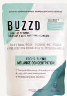
Buzzd Superfood Creamer Vitality or Focus Blend 200g