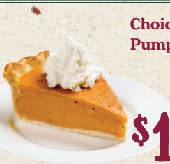
Choices Gluten-Free Pumpkin Pie