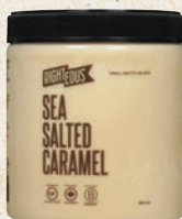
Righteous Dairy Free Gelato 562 mL

Delicious treats made in the heart of the Alps.