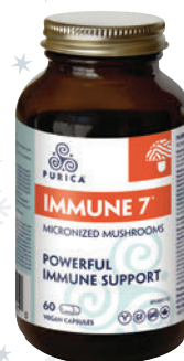
Purica Immune 7 Assorted Varieties & Sizes