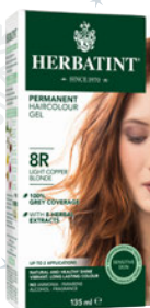
Herbatint Natural Permanent Hair Colour 1 Kit

Upgrade your immune system with critical minerals through a daily dose of this unprocessed, natural, straight from the ocean superfood! Can be applied topically or ingested. Anti-inflammatory properties make sea moss excellent for dry & sensitive skin, providing relief from symptoms of rashes, eczema and psoriasis. Prep with a rinse, soak, strain and blend. Make a full batch and keep in the fridge or freezer, adding to your daily shake or taking it straight up.