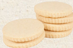
Choices Shortbread Cookies