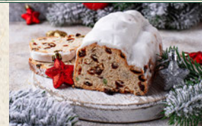
Choices Christmas Fruit Cake