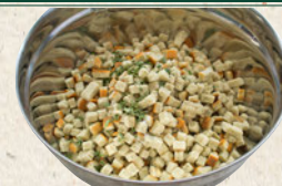
Choices Gluten-Free Stuffing Mix