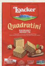
Loacker Wafers 250 g

Deliciously simple crackers made from black and red rice.