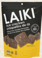
Laiki Rice Crackers 100g

Premium spreads and jams made in the finest French tradition.