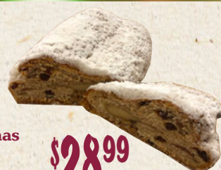
Choices Christmas Stollen Large