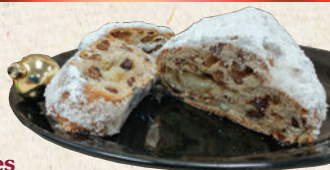
Choices Christmas Stollen Small or Medium

Small batch, plant-based gelato made with only the good stuff.