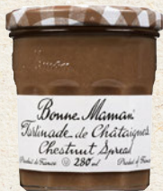
Bonne Maman Jams & Spreads 250g

Baked in small batches, with the finest quality, visually appealing, familiar ingredients.