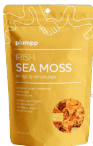
Plumpp Irish Sea Moss 40g/120g

Immune 7 is an excellent option for those with suppressed immune systems, stress, infectious disease including cold and flu, allergies and skin conditions as well as athletes or those who exercise.