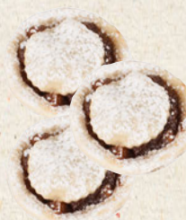
Choices Mincemeat Tarts