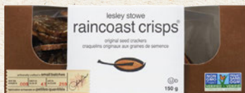
Lesley Stowes Organic Crisps 150g

The trusted choice for Canadians for over a century with award-winning cheese makers working every day to produce premium cheese.