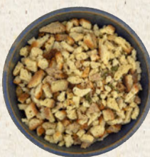
Choices Stuffing Bread