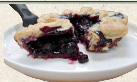
Choices Artisan Fruit Pies