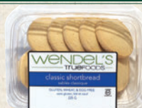
Wendals Gluten-Free Shortbread or Ginger Babies