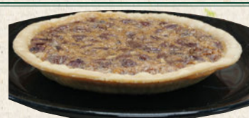
Choices Pecan Walnut Pie