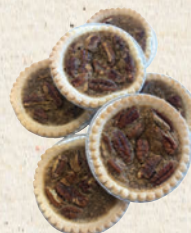
Choices Tarts Butter or Pecan