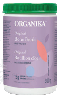
Organika Bone Broths Original or Ginger 300g

Become a Wellness Shopper today. DISCOVER SAVINGS & EARN POINTS Ask us for details in store.