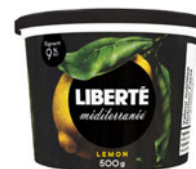
Liberté Méditerranée Yogurts 500g

Prepare a delicious smoothie in seconds with Evive! Just pop, add liquid, shake & enjoy!