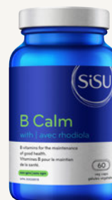
Sisu Stress and Sleep Supplements Assorted Varieties & Sizes

Results driven formulas are only as effective as their delivery method. This inspired the development of the exclusive GPS enteric coating. It keeps harsh stomach acid from seeping into the capsule and protects it from disintegrating in your stomach. This safeguards the delicate probiotics and preserves their viability until they reach the safety of your intestines! Once there, the capsule releases live, healthy, colony forming probiotics, which get to work on improving your gut health!