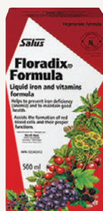
Salus Floradix & Floravit Liquid Iron Formula 250 mL/500 mL

Become a Wellness Shopper today. DISCOVER SAVINGS & EARN POINTS Ask us for details in store.