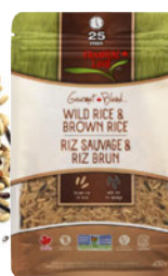
Floating Leaf Rice