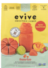
Evive Smoothie Cubes Frozen, 405g

Indulge guilt-free with Zevia's naturally sweet, zero-sugar, zero-calories drinks.