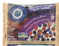
Stahlbush Island Farms Sustainable Frozen Fruit 283g & 300g

Our take on the quintessential homemade sauce straight from the kitchen at Carbone.