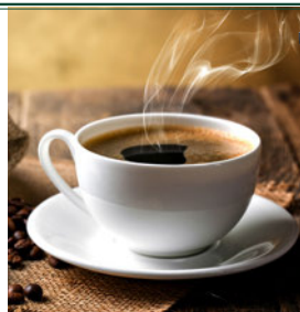
Kicking Horse Organic Fairtrade Coffee Whole Bean, 454g

Tree-free TP made from sustainable bamboo.