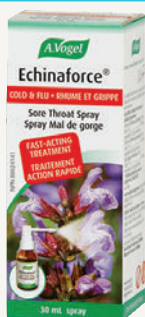
A. Vogel Echinaforce Supplements Assorted Varieties & Sizes

Full-spectrum B vitamin formula plus rhodiola to support overall health, particularly in people under physical or mental stress. B vitamins support the nervous system, adrenal function, and hormonal balance and combat deficiencies caused by various chronic diseases, a vegetarian diet, stress, and age. Rhodiola is an adaptogen, meaning it normalizes production of certain hormones within the nervous system to invigorate a sluggish system or calm an agitated one. It is clinically proven to decrease mental fatigue, improve mental and physical performance during periods of work-related stress, and promote general well-being.