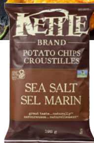
Kettle Brand Potato Chips 198g