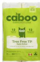
Caboo Bathroom Tissue 4's, 12's & 24's

Plant-based products that aren't just delicious — but are also better for you, your food, and the planet.