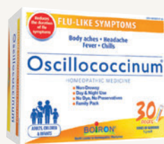
Boiron Oscilloccinum 6 Doses/30 Doses