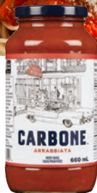
Carbone Premium Pasta Sauce 660 mL