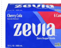
Zevia Stevia Sweetened Soda Pack of 6

Our living foods are authentically fueled by organic plants, raw fermentation and naturally occurring probiotics.