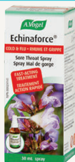
A. Vogel Echinaforce Supplements Assorted Varieties & Sizes

Full-spectrum B vitamin formula plus rhodiola to support overall health, particularly in people under physical or mental stress. B vitamins support the nervous system, adrenal function, and hormonal balance and combat deficiencies caused by various chronic diseases, a vegetarian diet, stress, and age. Rhodiola is an adaptogen, meaning it normalizes production of certain hormones within the nervous system to invigorate a sluggish system or calm an agitated one. It is clinically proven to decrease mental fatigue, improve mental and physical performance during periods of work-related stress, and promote general well-being.