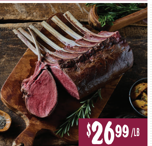
Lamb Racks or Rib Chops Fresh, Raised Without Antibiotics,Pasture Raised, Product of New Zealand, $59.50/KG