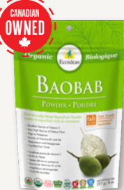
Ecoideas Superfoods Assorted Varieties & Sizes