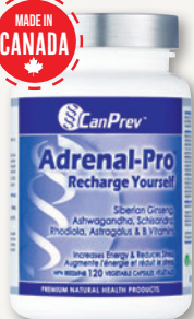
CanPrev Adrenal-Pro Recharge Yourself 120 Capsules