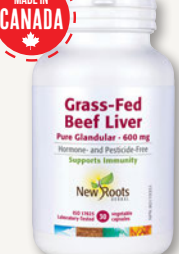
New Roots Grass-Fed Beef Liver 30 Capsules