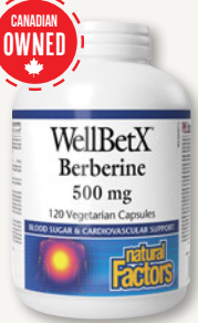
Natural Factors WellBetX Berberine Assorted Varieties & Sizes