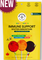
Beekeeper's Naturals Immune Support Wellness Wands 15-Pack